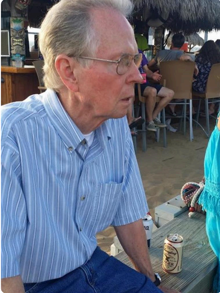
Sept 2016 at Kentmorr